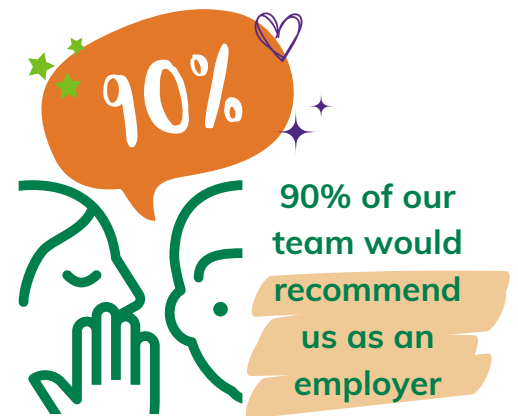
According to our 2022 staff survey

Visit herriothh.org.uk or email partnerships@herriothh.org.uk